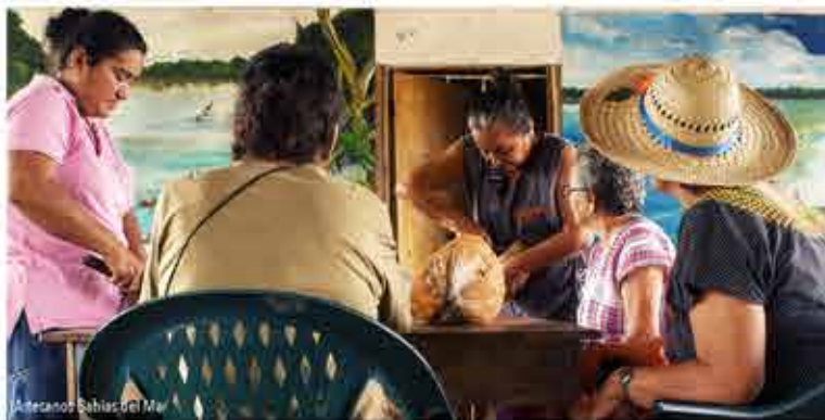
Artesanos Bahías del Mar